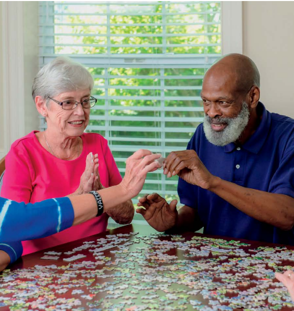
Senior Living Choices from Liberty Senior Living